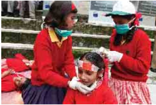
Students being given first aid after safe evacuation from the classroom during a school mock drill.