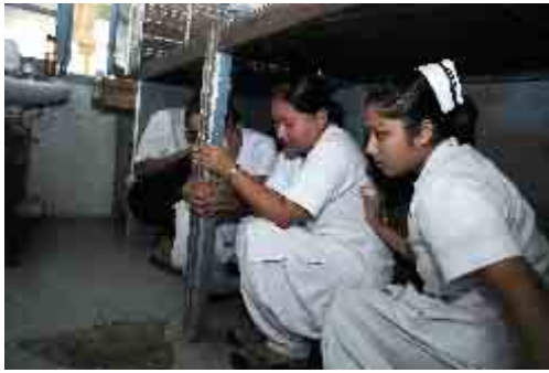
Hospital staff in the 'duck, cover and hold' position during the hospital mock drill.