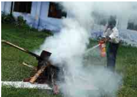
Fire extinguishing practice during the community drill.