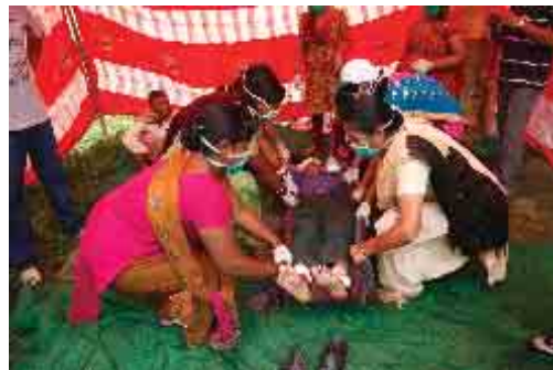
The first aid safety team in action during the community mock drill.