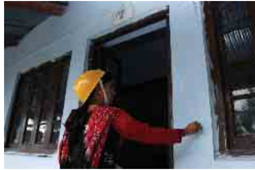
The search and rescue team marking the outside of the classroom to indicate that the room has been searched.