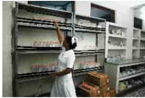
Non-structural mitigation done in the hospitals as part of the project.